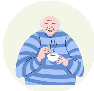
No Age Limits